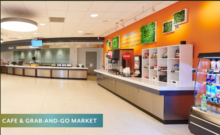
CAFE & GRAB-AND-GO MARKET