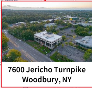
7600 Jericho Turnpike Woodbury, NY