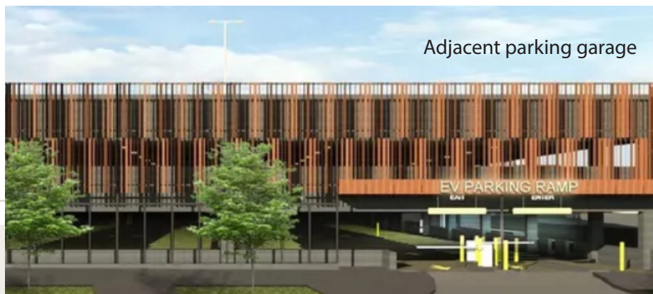
Adjacent parking garage