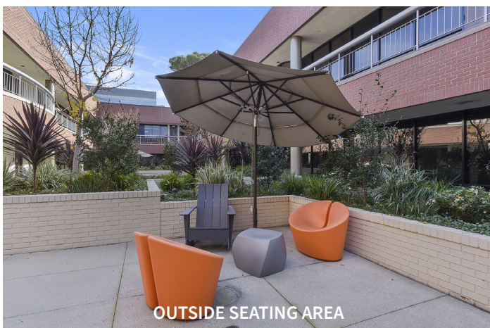
OUTSIDE SEATING AREA