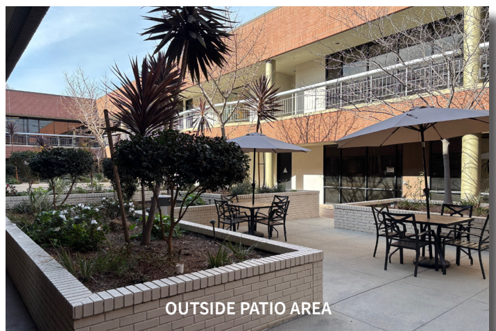
OUTSIDE PATIO AREA