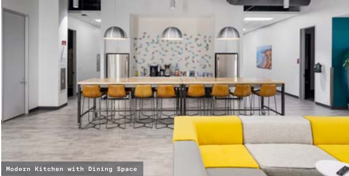
Modern Kitchen with Dining Space