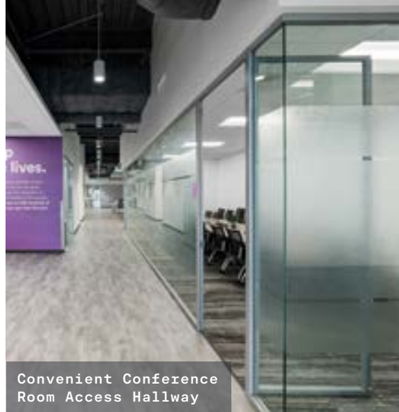
Convenient Conference Room Access Hallway