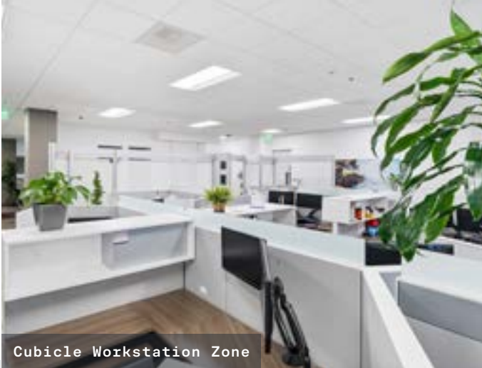
Cubicle Workstation Zone