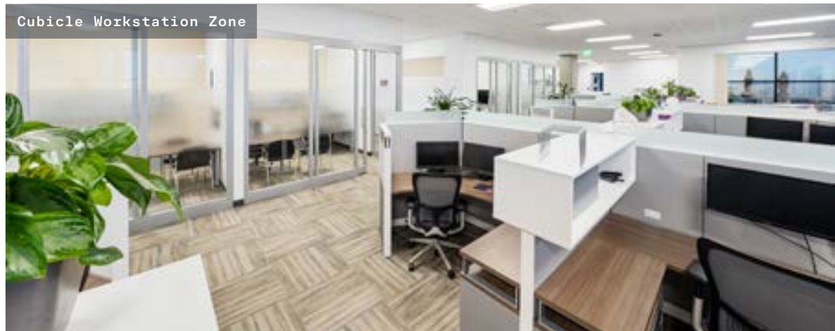
Cubicle Workstation Zone