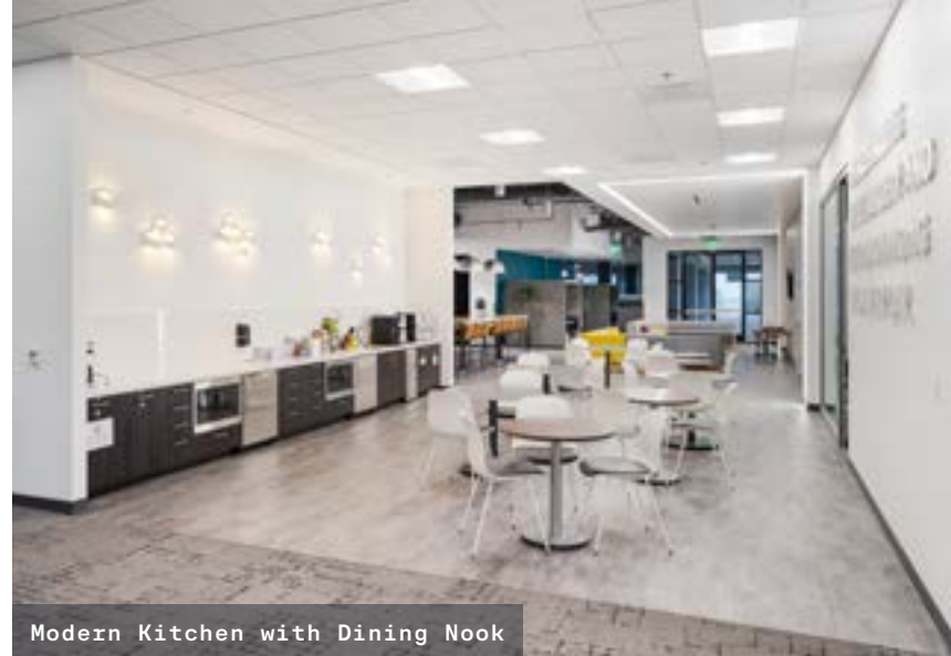
Modern Kitchen with Dining Nook