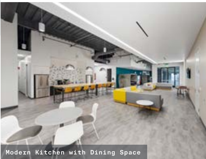
Modern Kitchen with Dining Space