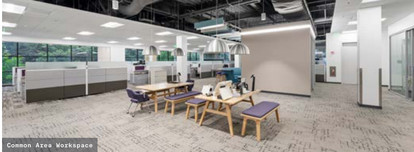
Common Area Workspace