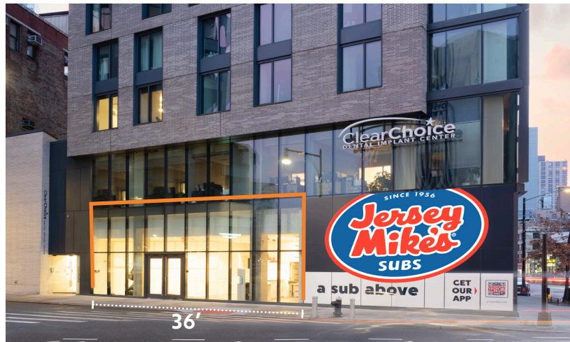
Red Hook Lane