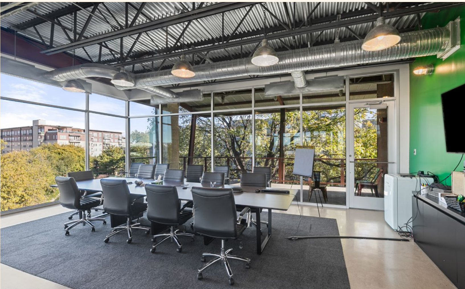
Suite 200 | 7,345 RSF