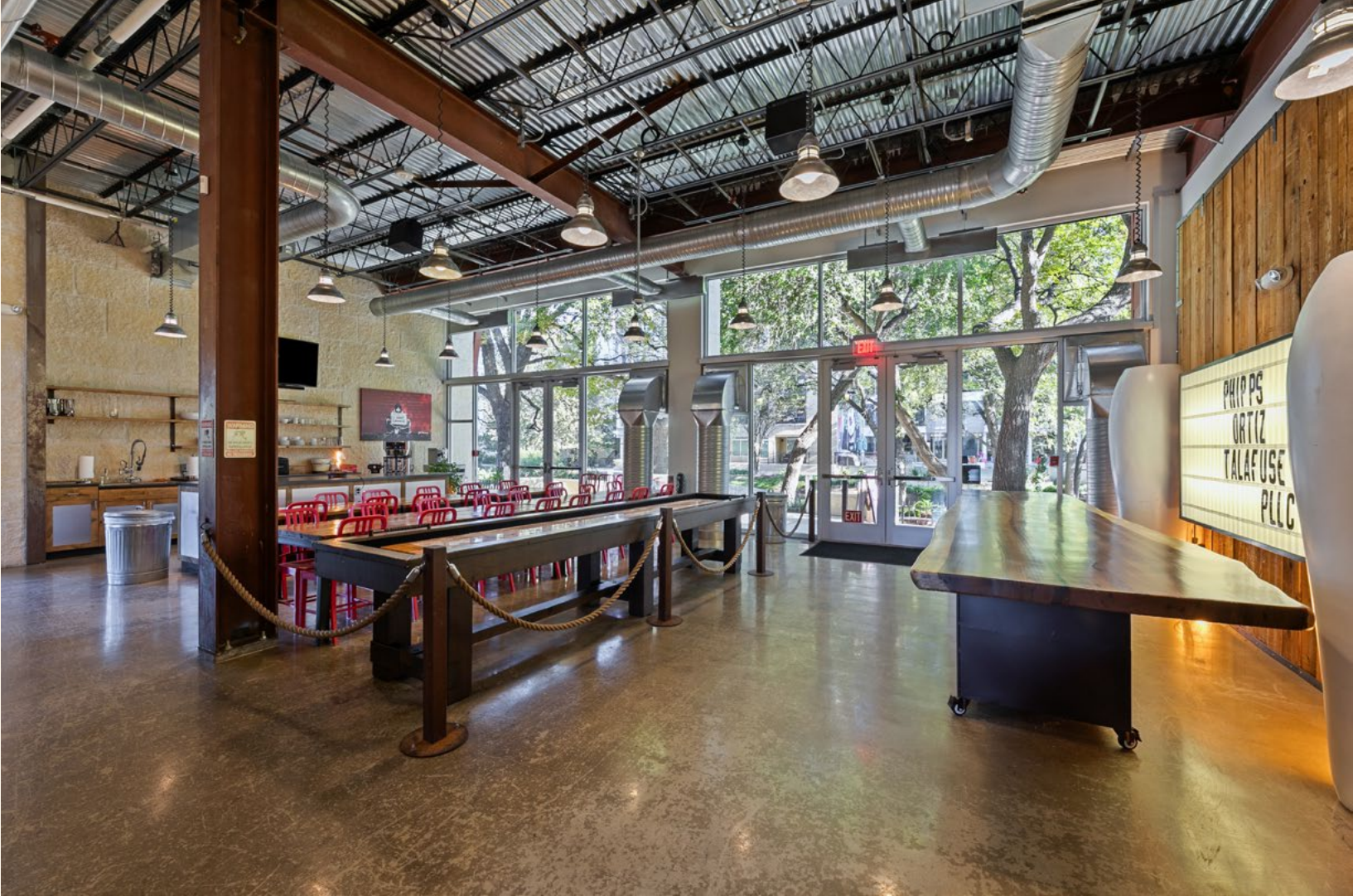
Suite 301 | 7,062 RSF