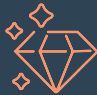
HIGH-END FINISHES THROUGHOUT