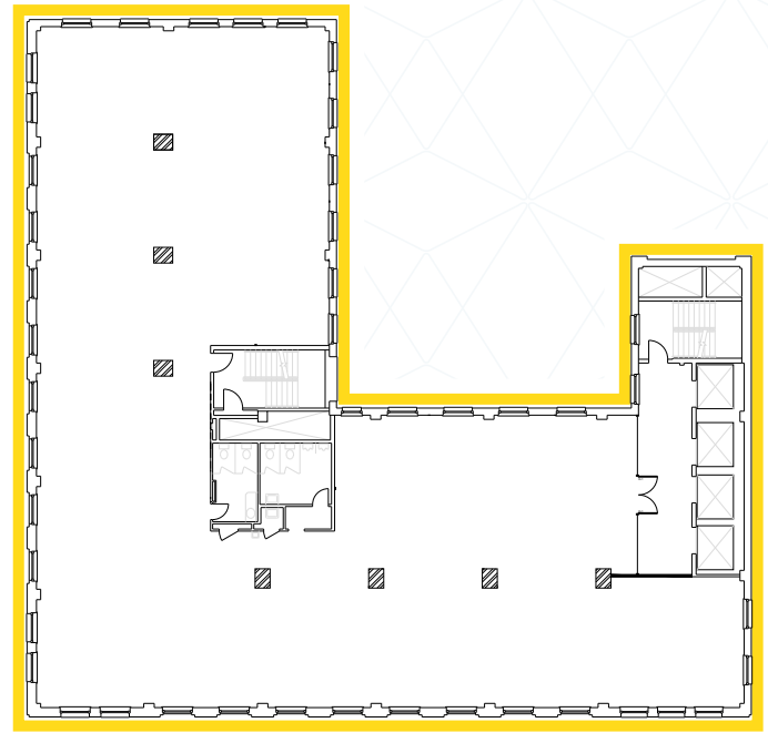
REPRESENTATIVE PLAN ±8,743 RSF

1411 Fourth's design prioritized natural light and fresh air from early conception. The building's functional floor plates and ceiling heights continue to stand out as optimal shells for the modern tenant.