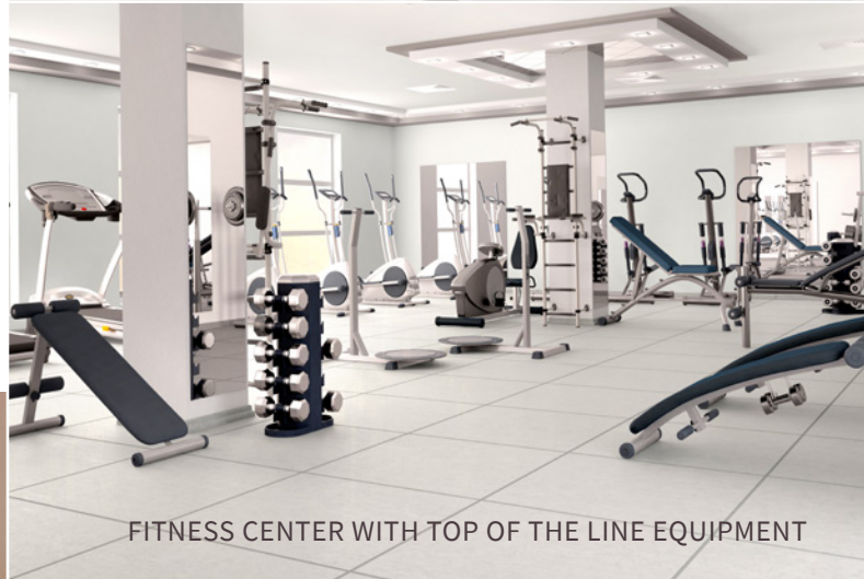
FITNESS CENTER WITH TOP OF THE LINE EQUIPMENT