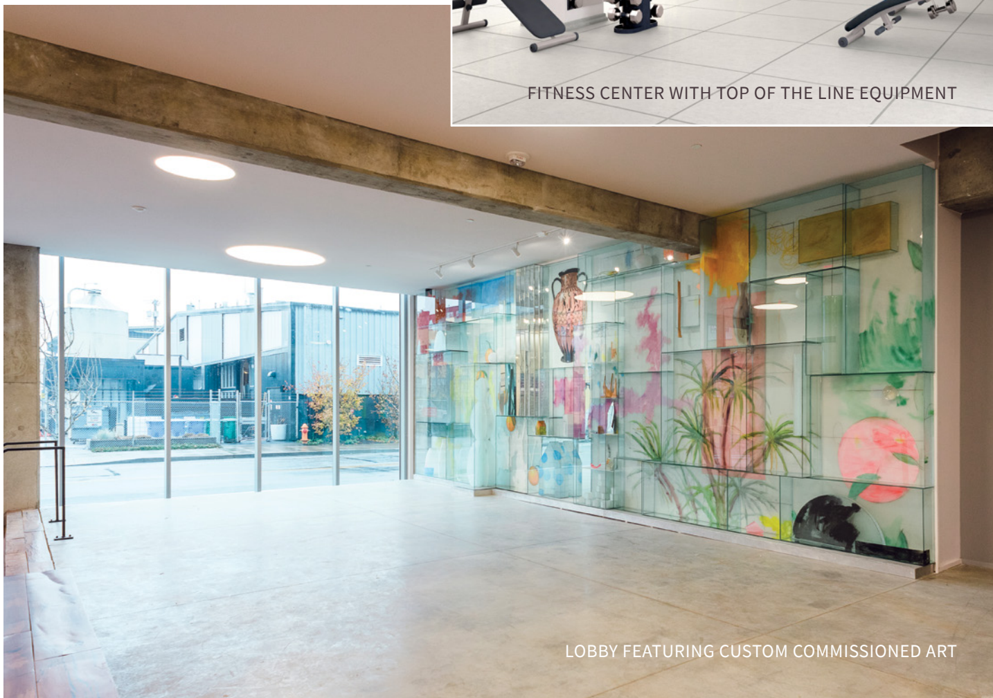
LOBBY FEATURING CUSTOM COMMISSIONED ART