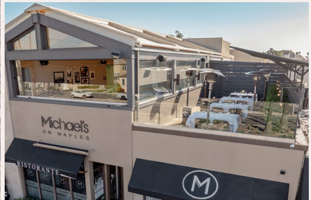
Retractable Rooftop Bar