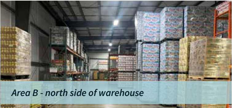
Area B - north side of warehouse