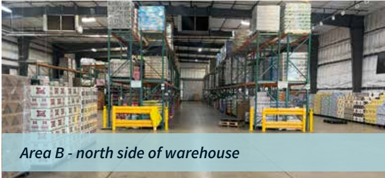
Area B - north side of warehouse