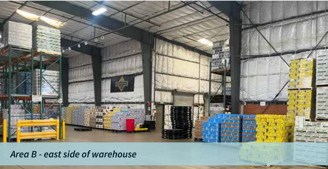
Area B - east side of warehouse