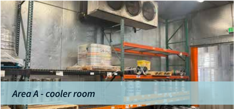
Area A - cooler room