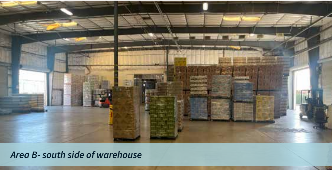
Area B - south side of warehouse