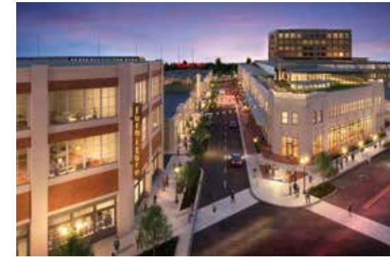
Office, Retail, Hoteling