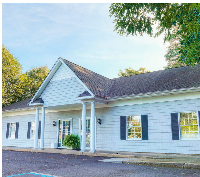
410 Hallock Avenue Port Jefferson Station, NY