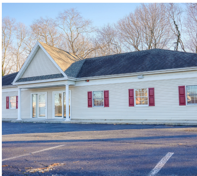
500 Hallock Avenue Port Jefferson Station, NY