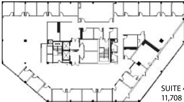
SUITE 400 11,708 S.F.