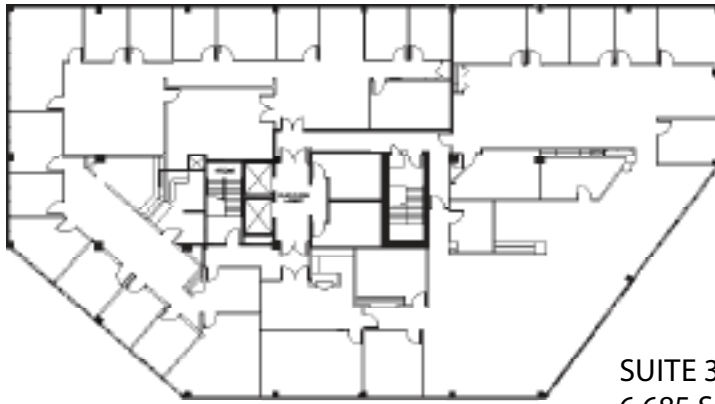
SUITE 310 6,685 S.F.

220 COMMERCE DRIVE Fort Washington, PA 19034