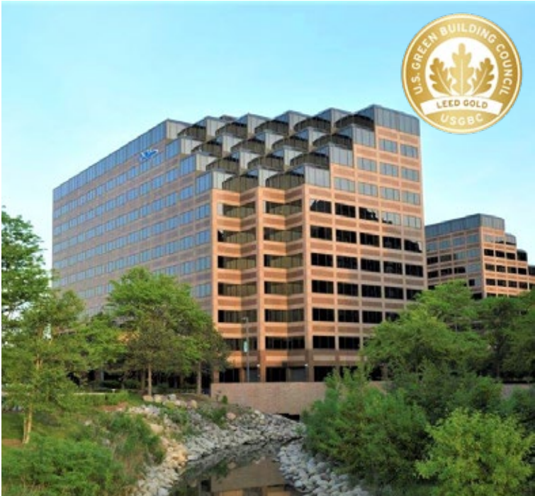
6133 N River Road