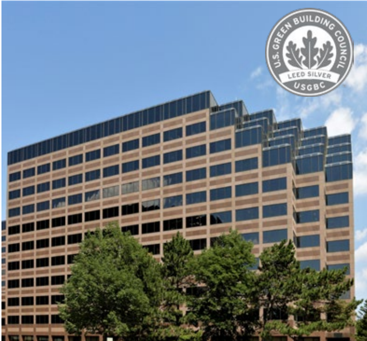
9377 W Higgins Road