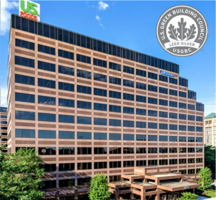
9399 W Higgins Road