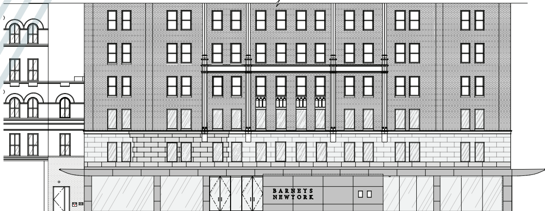
7TH AVENUE FACADE