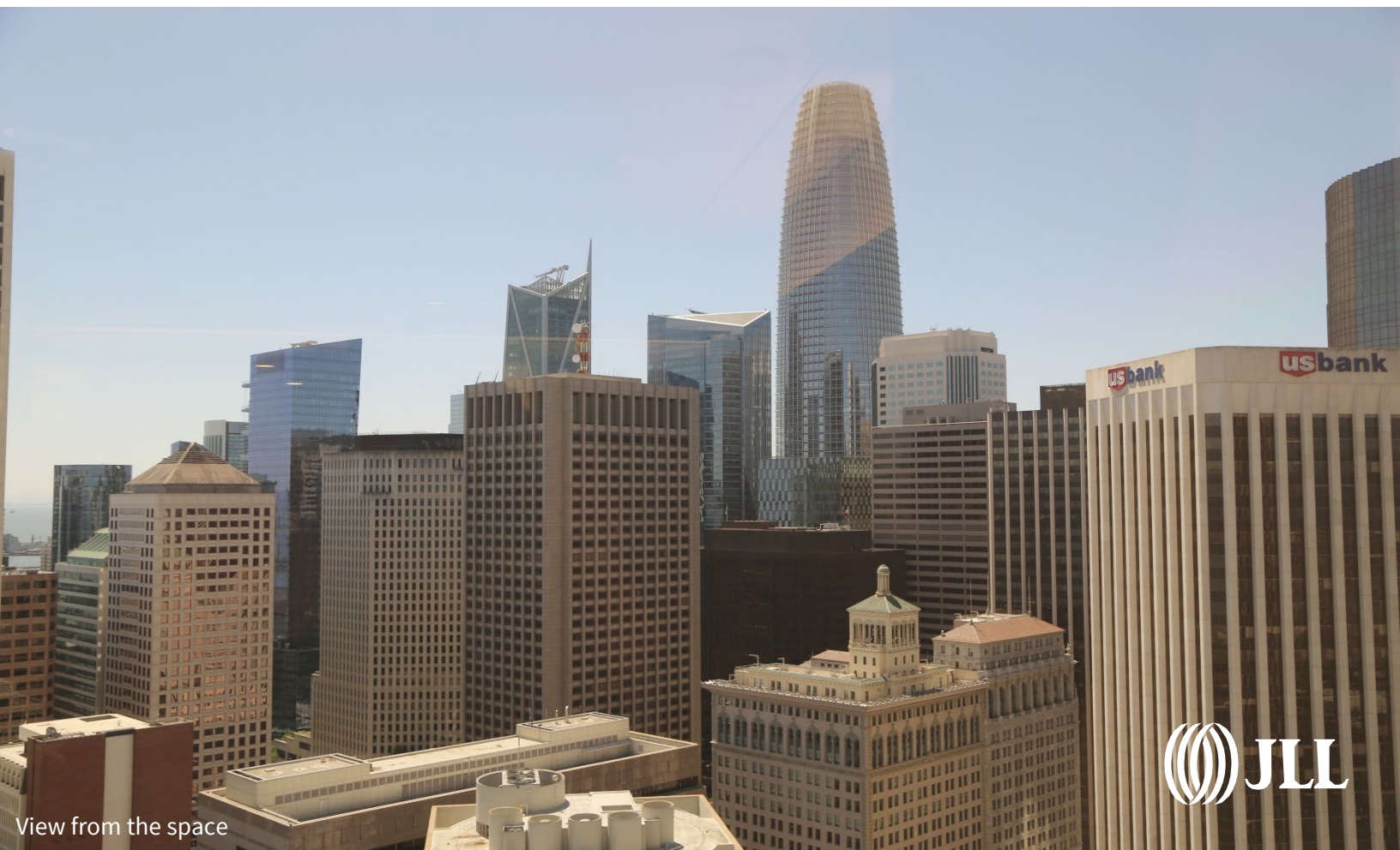
View from the space