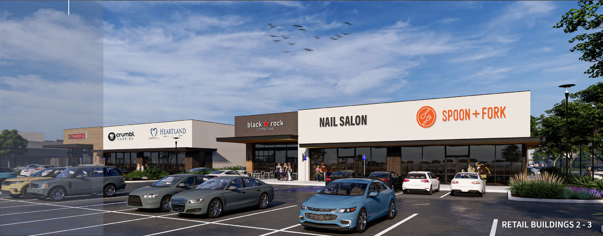
RETAIL BUILDINGS 2 - 3