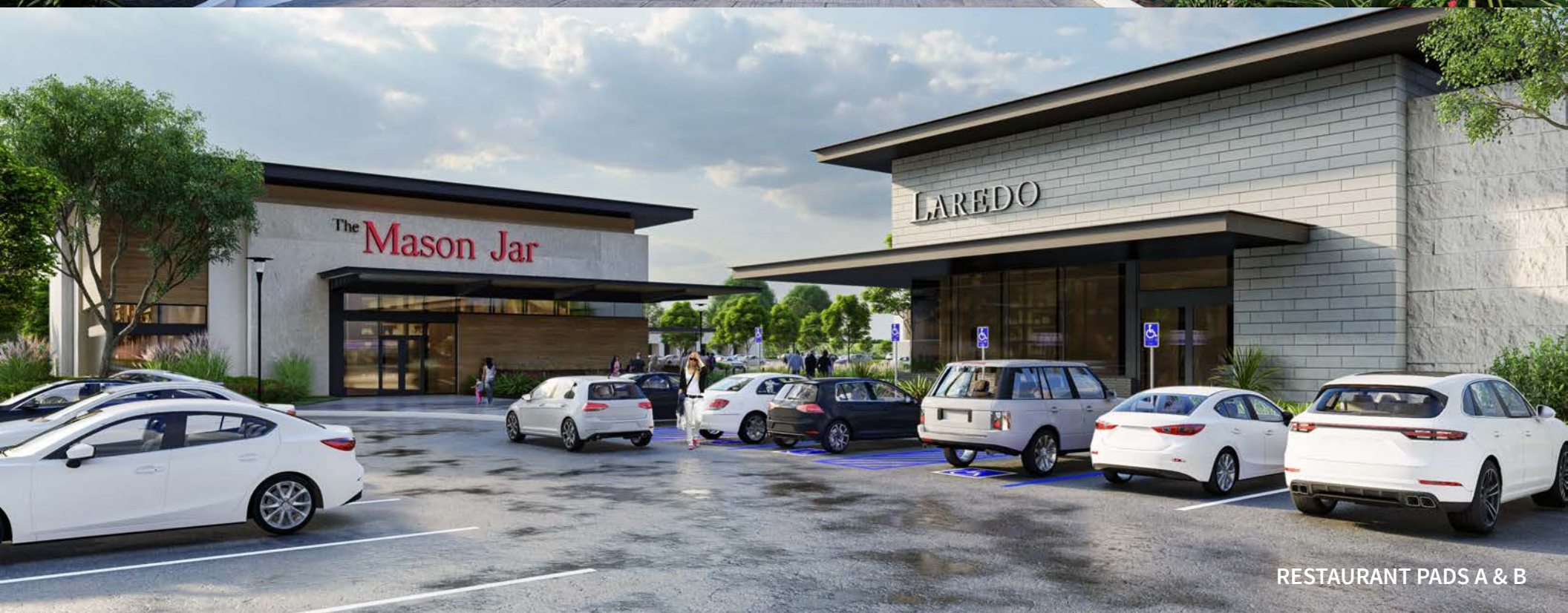
RESTAURANT PADS A & B