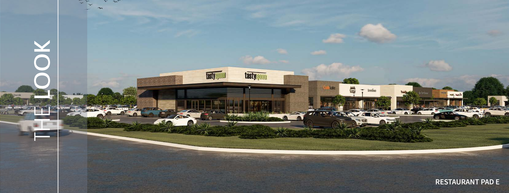
RESTAURANT PAD E