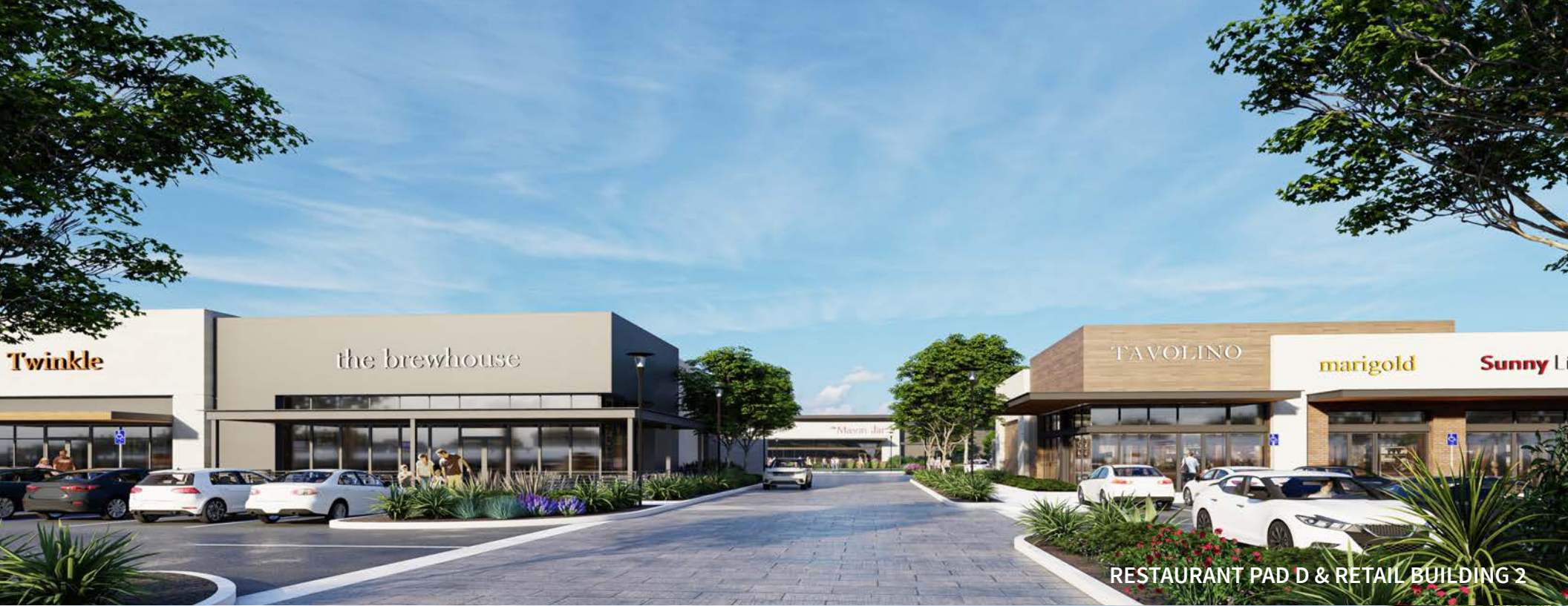
RESTAURANT PAD D & RETAIL BUILDING 2