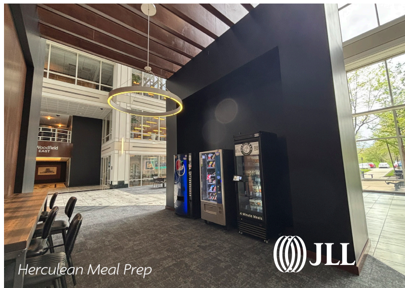
Herculean Meal Prep