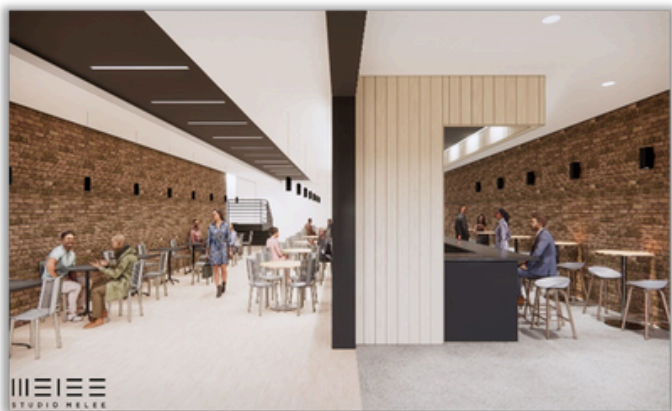
1st floor (conceptual renderings)