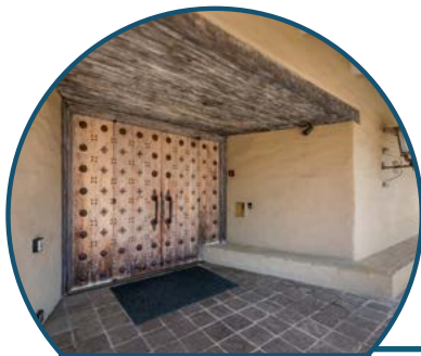
Ranch Style Main Entry Way