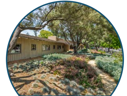
Well Maintained Landscaped Exteriors