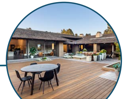
Central Outdoor Courtyard