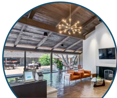
Modern Interior Finishes