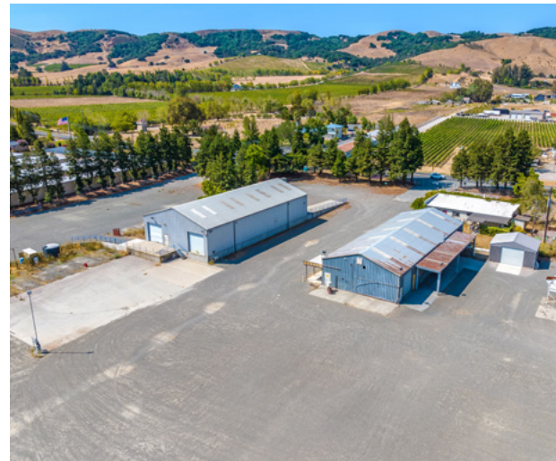
OUTDOOR STORAGE YARD: