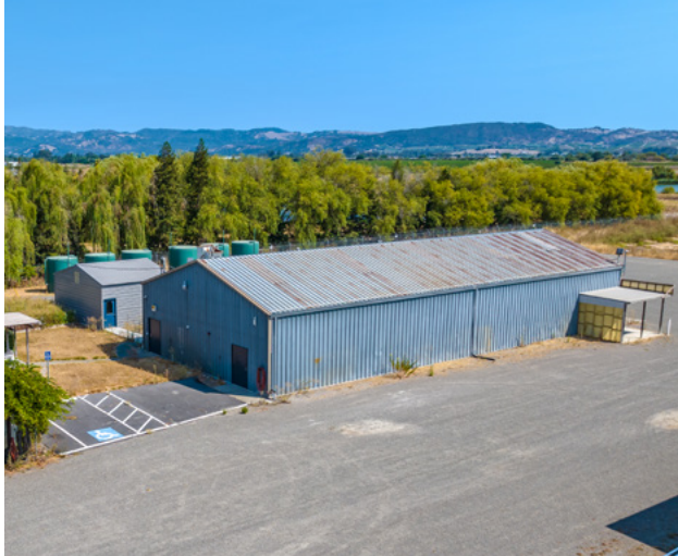
WAREHOUSE A + WORKSHOP: