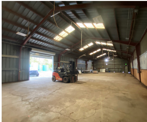
WAREHOUSE A INTERIOR: