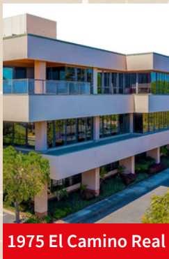
1975 El Camino Real

Although information has been obtained from sources deemed reliable, JLL does not make any guarantees, warranties or representations, express or implied, as to the completeness or accuracy as to the information contained herein. Any projections, opinions, assumptions or estimates used are for example only. There may be differences between projected and actual results, and those differences may be material. JLL does not accept any liability for any loss or damage suffered by any party resulting from reliance on this information. If the recipient of this information has signed a confidentiality agreement with JLL regarding this matter, this information is subject to the terms of that agreement. ©2025. Jones Lang LaSalle IP, Inc. All rights reserved.