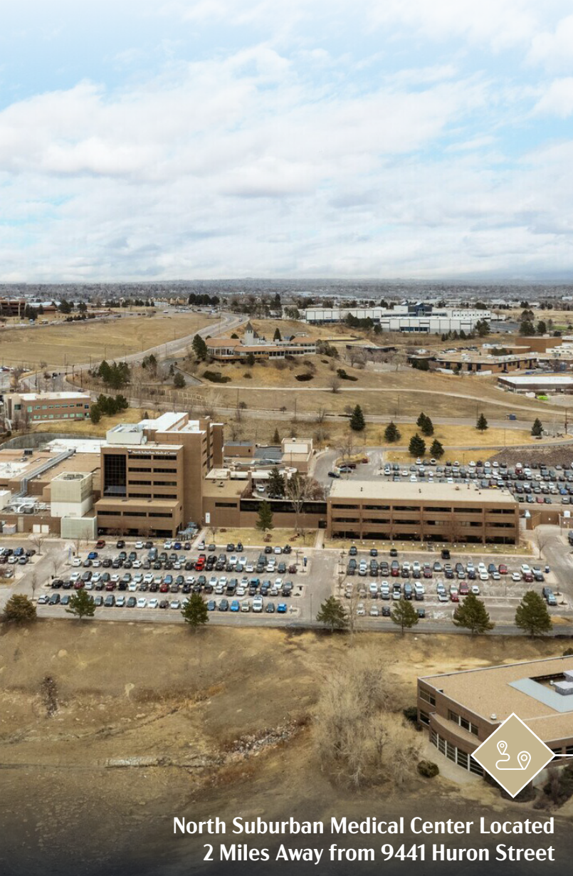
North Suburban Medical Center Located 2 Miles Away from 9441 Huron Street