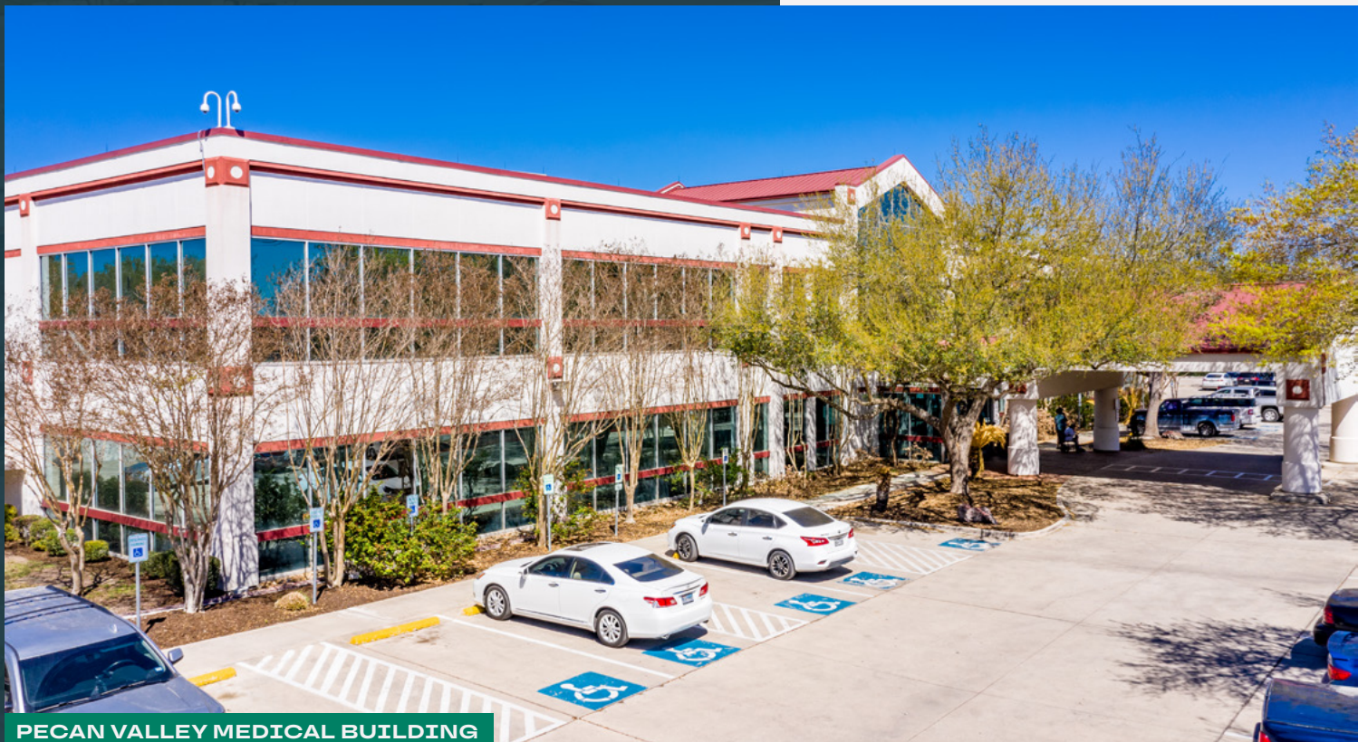
PECAN VALLEY MEDICAL BUILDING