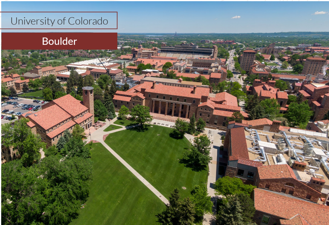
University of Colorado