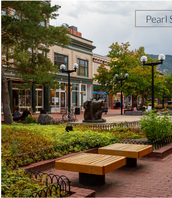
Pearl Street Mall