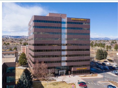
143 Union Boulevard