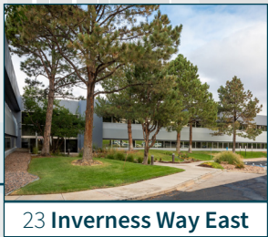
23 Inverness Way East