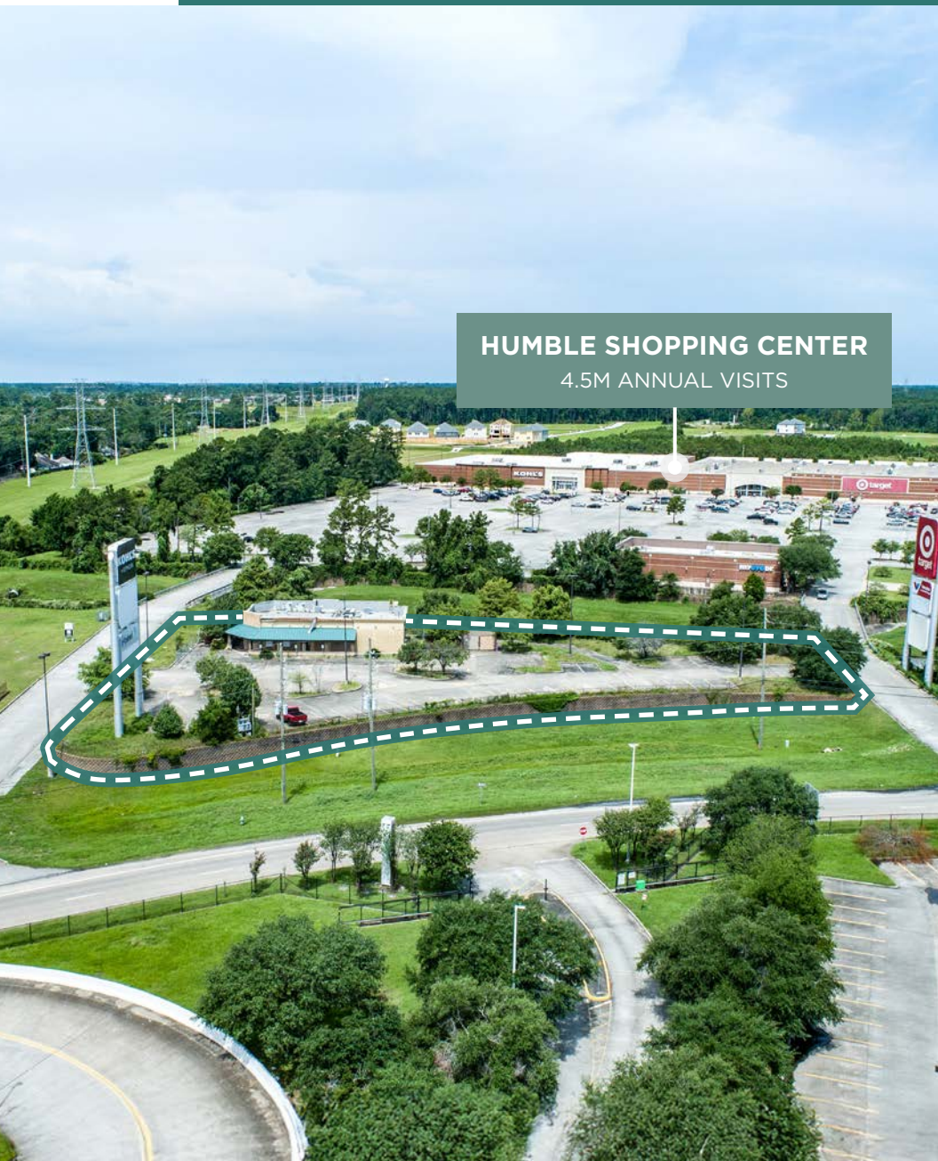
HUMBLE SHOPPING CENTER 4.5M ANNUAL VISITS