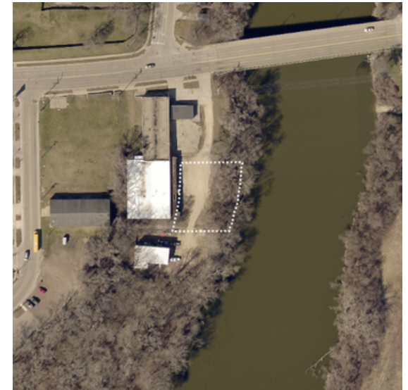
Parcel 2 - 0.33 acres