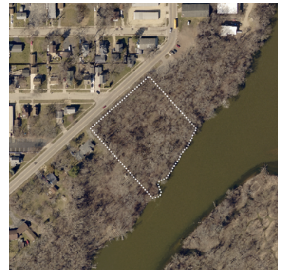
Parcel 4 - 2.50 acres

Although information has been obtained from sources deemed reliable, neither Owner nor JLL makes any guarantees, warranties or representations, express or implied, as to the completeness or accuracy as to the information contained herein. Any projections, opinions, assumptions or estimates used are for example only. There may be differences between projected and actual results, and those differences may be material. The Property may be withdrawn without notice. Neither Owner nor JLL accepts any liability for any loss or damage suffered by any party resulting from reliance on this information. If the recipient of this information has signed a confidentiality agreement regarding this matter, this information is subject to the terms of that agreement. ©2025. Jones Lang LaSalle IP, Inc. All rights reserved.