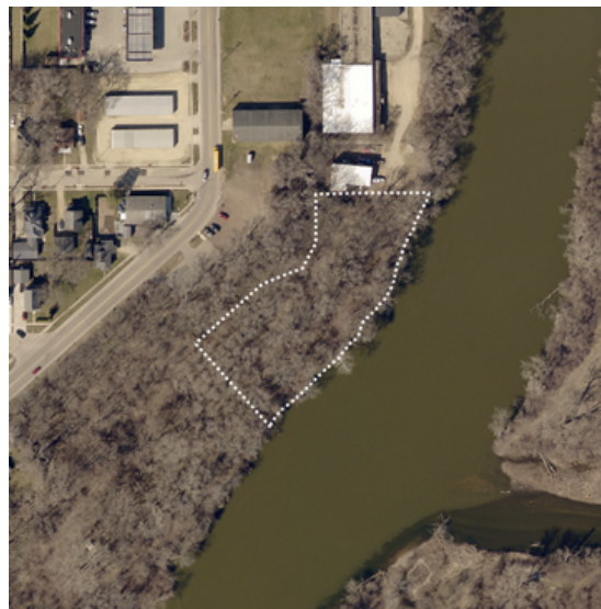
Parcel 3 - 1.44 acres