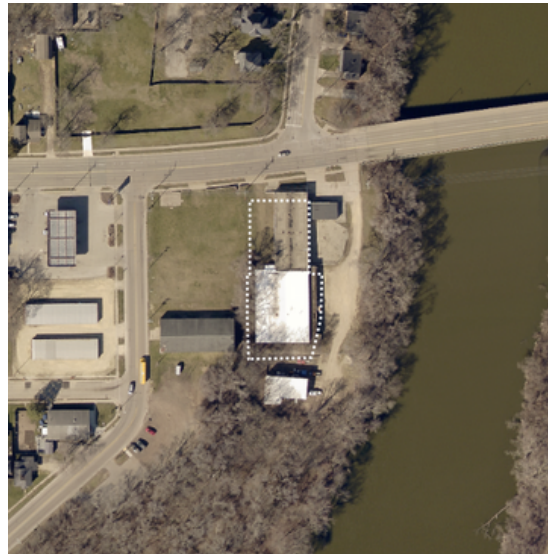
Parcel 1 - 14,675 sq.ft. on 0.55 acres