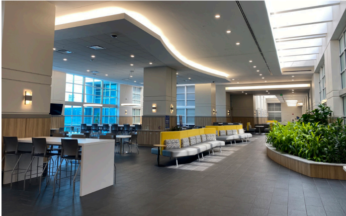
Break area corridor