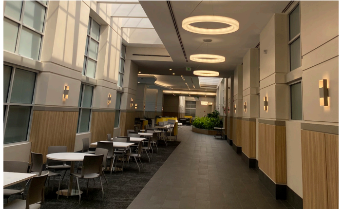
Lunch/break seating area