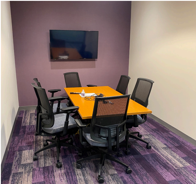
Multiple conference and huddle rooms