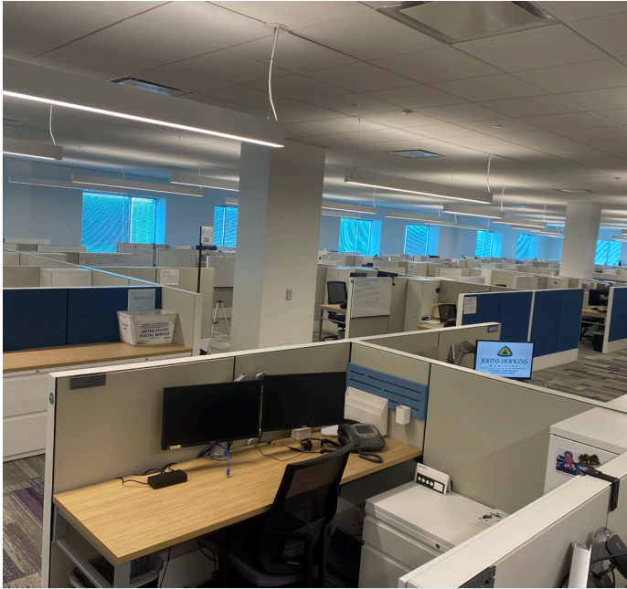
Typical work station