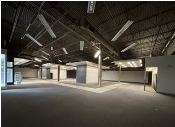
FOR LEASE - 20,059 SF