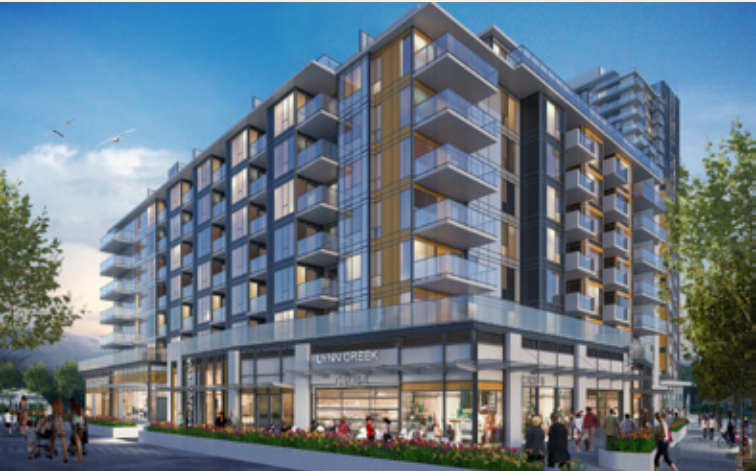
'Heart' of Lynn Creek Town Centre