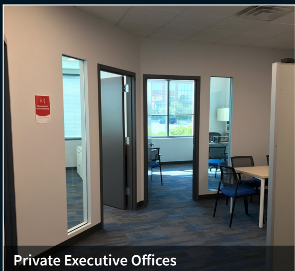
Private Executive Offices