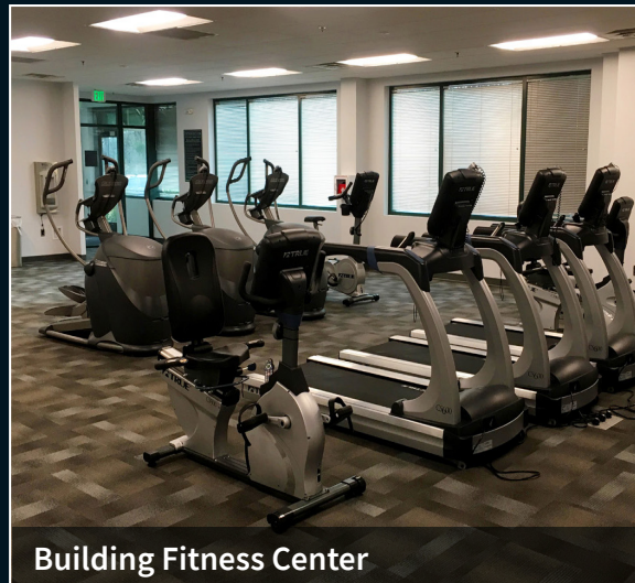
Building Fitness Center