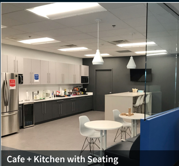
Cafe + Kitchen with Seating