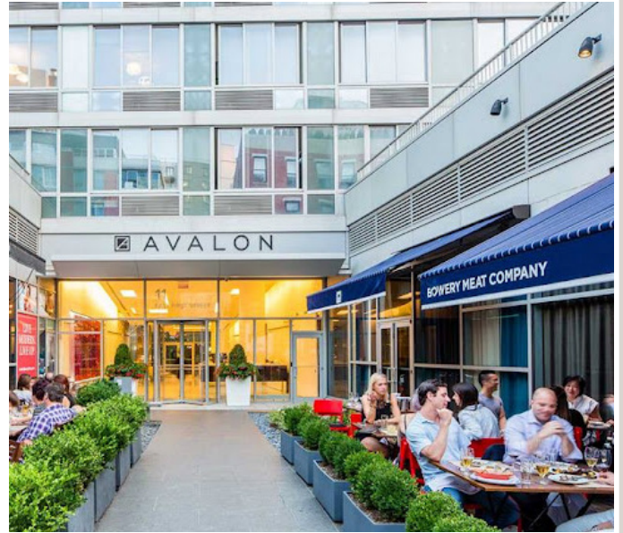
Bowery Meat Company