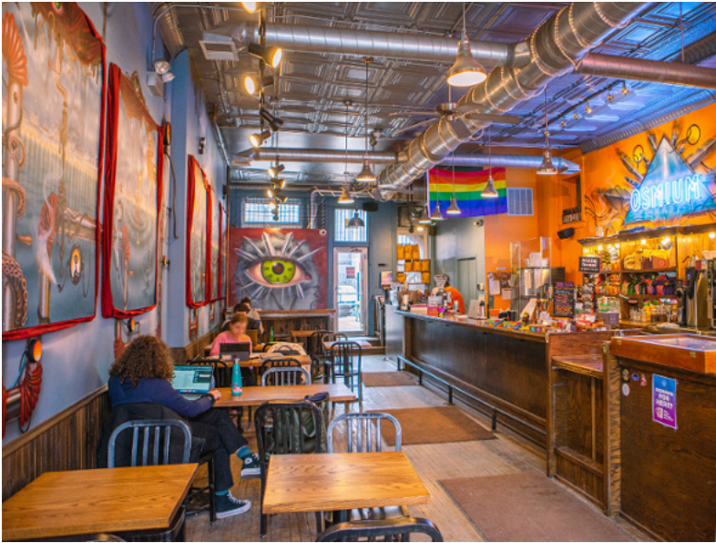
Dark Matter Coffee