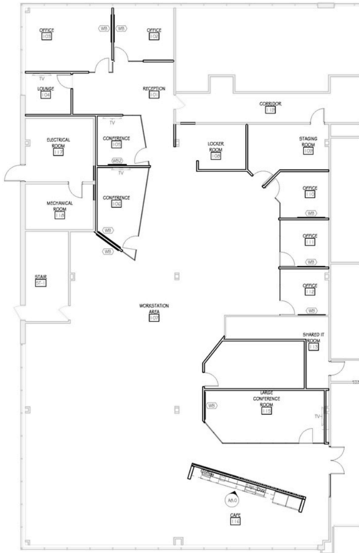
1 ST FLOOR - 9,000 SF