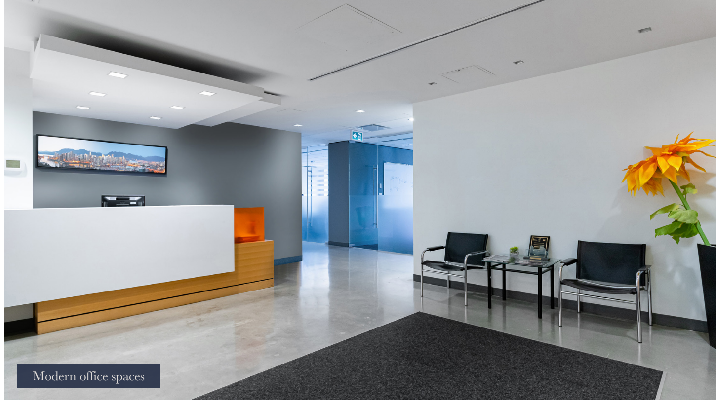
Modern office spaces