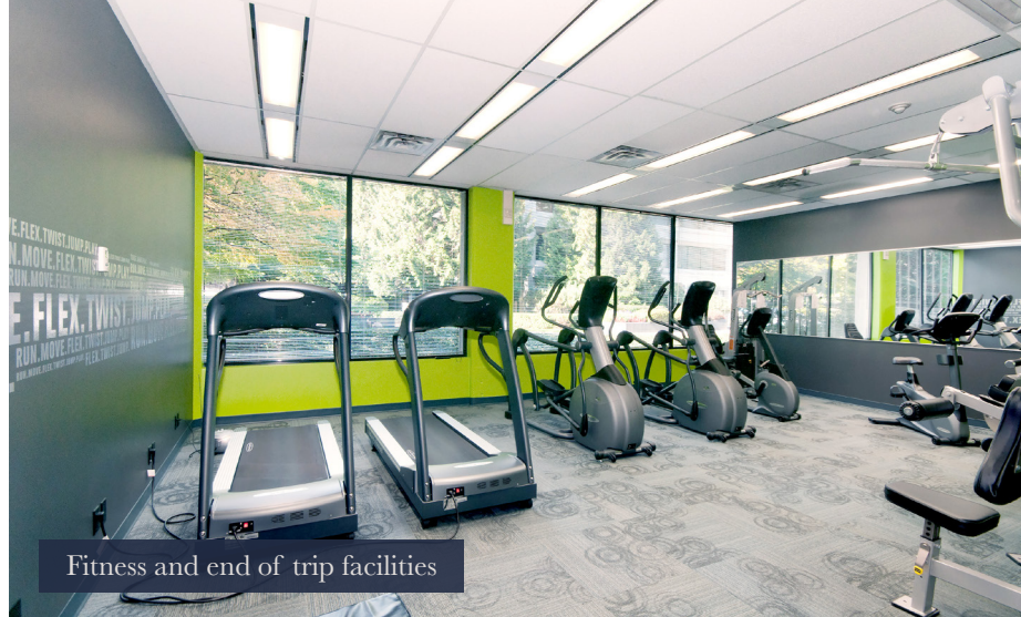
Fitness and end of trip facilities