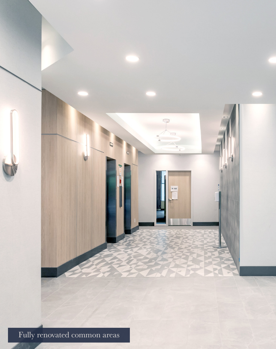
Fully renovated common areas