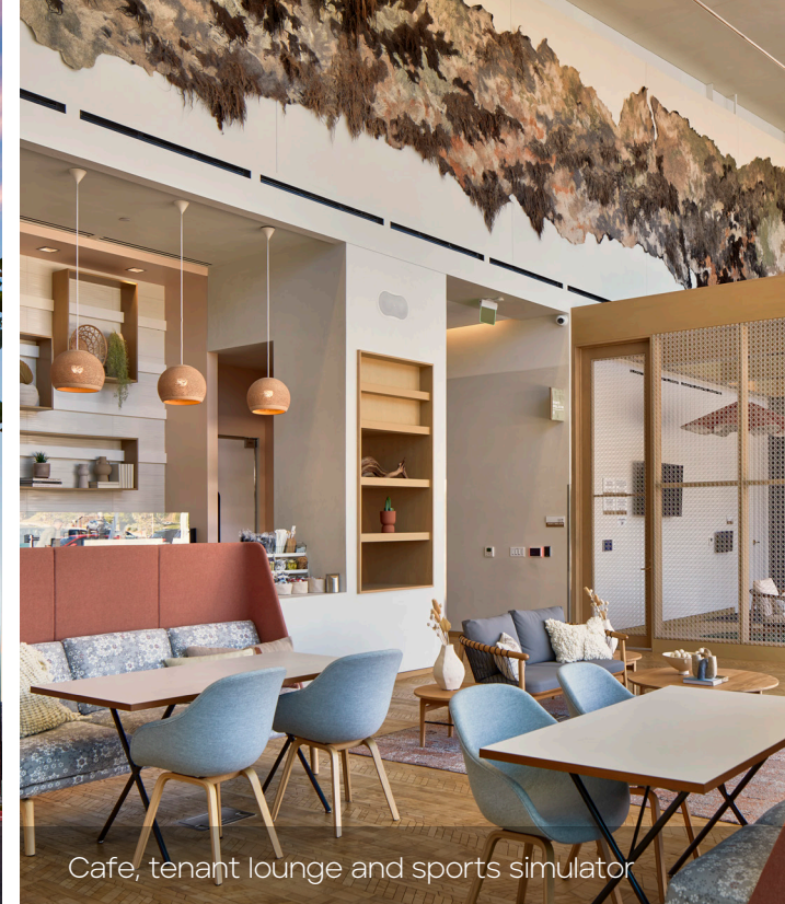
Cafe, tenant lounge and sports simulator