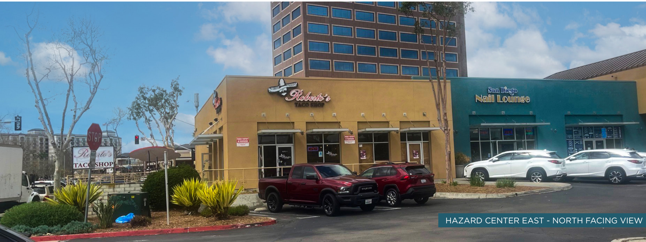
HAZARD CENTER EAST - NORTH FACING VIEW