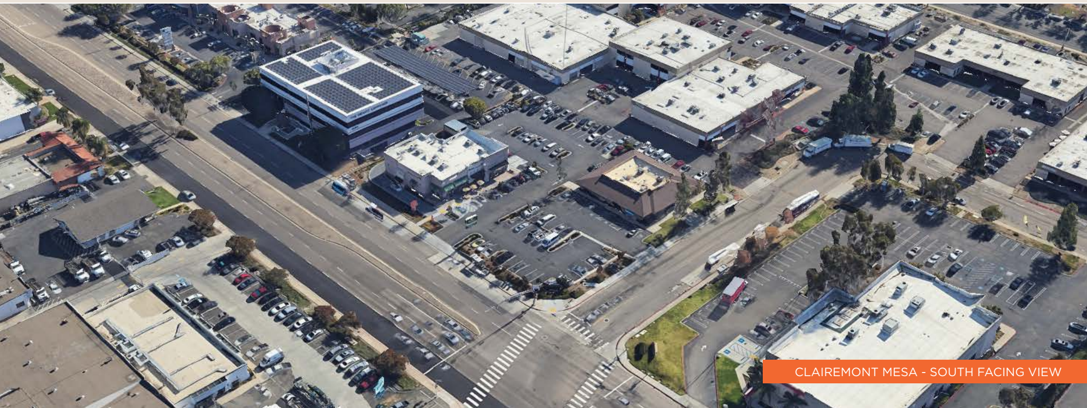
CLAIREMONT MESA - SOUTH FACING VIEW