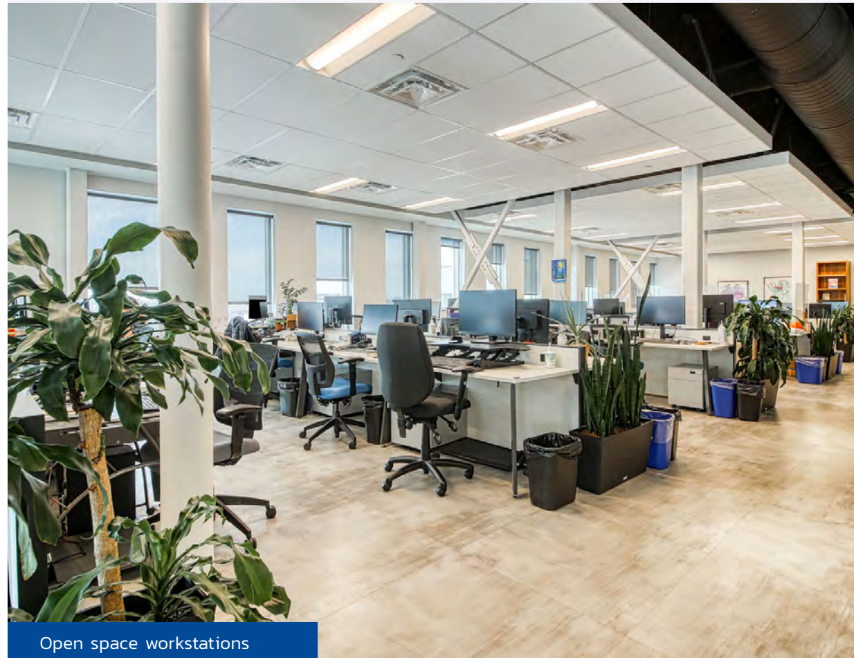
Open space workstations

A wide variety of large & small meeting rooms (4 to 100 people) is available at no fee. Large kitchen and lounge areas provide inviting collaboration centers to connect and exchange ideas.