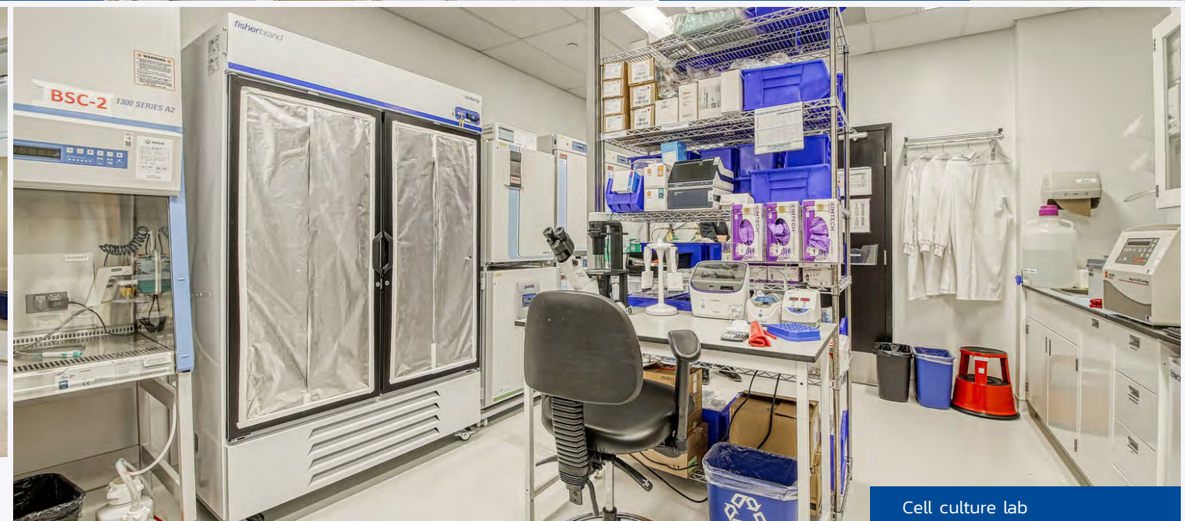
Cell culture lab