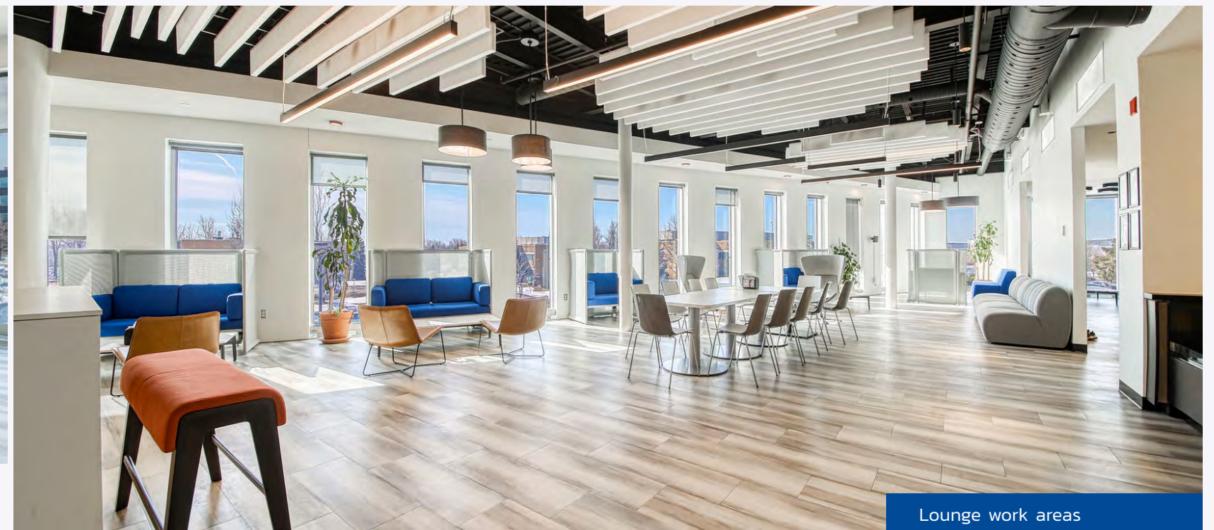
Lounge work areas