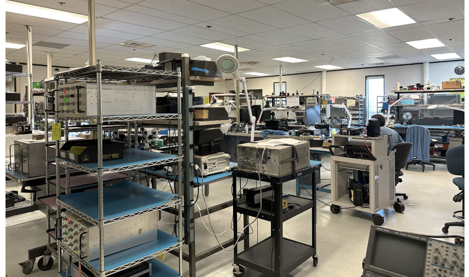
2205 Kramer Ln