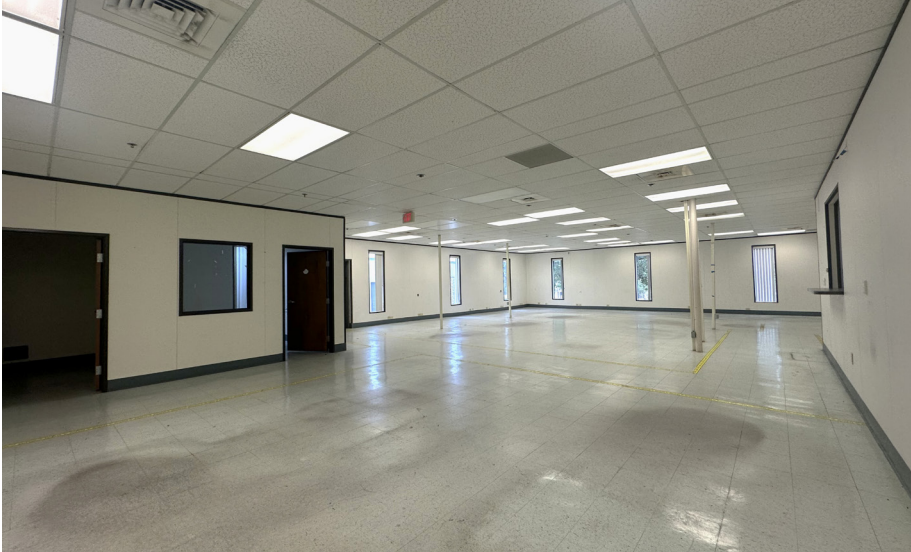
2215 Kramer Ln