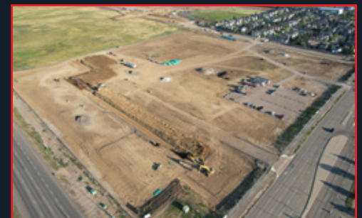
Development Update - August 2025