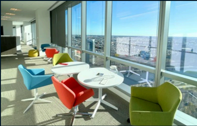
18 & 19 Floors