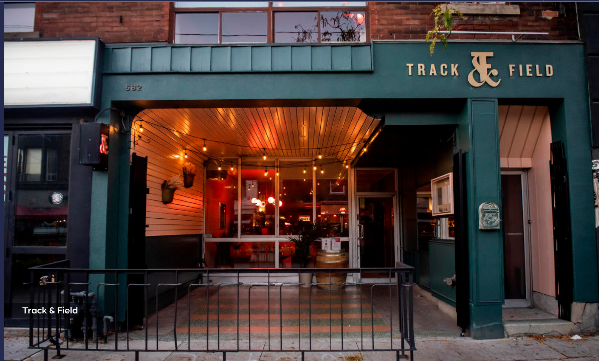
Track &amp; Field