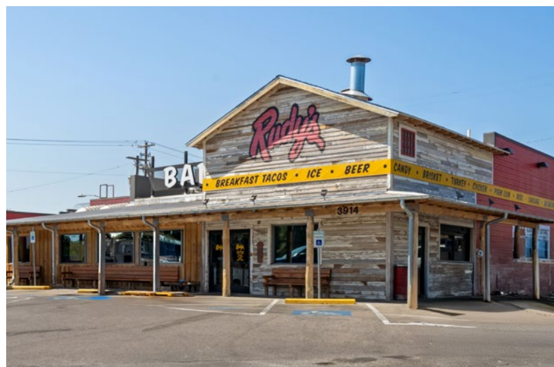
Rudy's "Country Store" and Bar-BQ