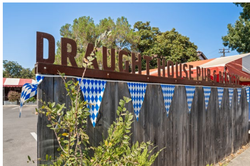
Draught House Pub & Brewery