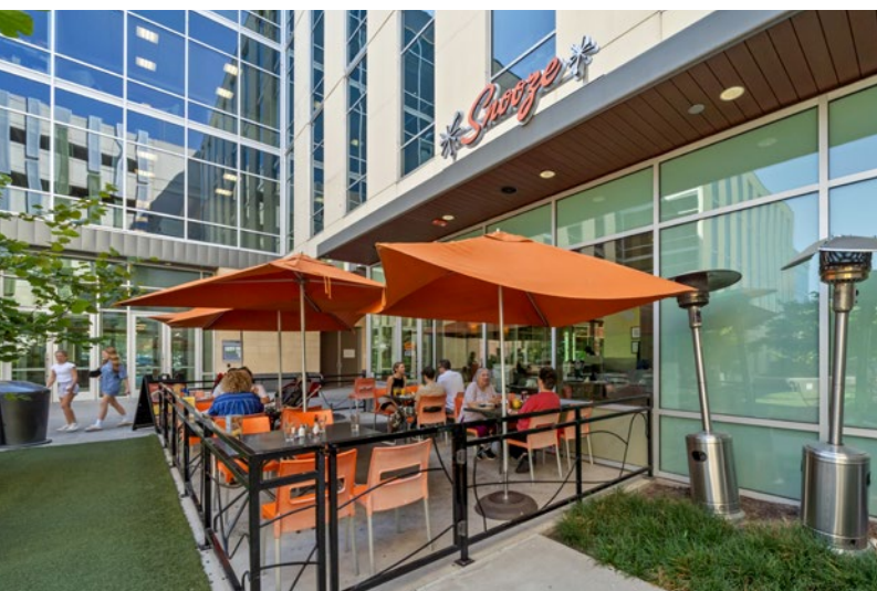
Snooze an AM Eatery