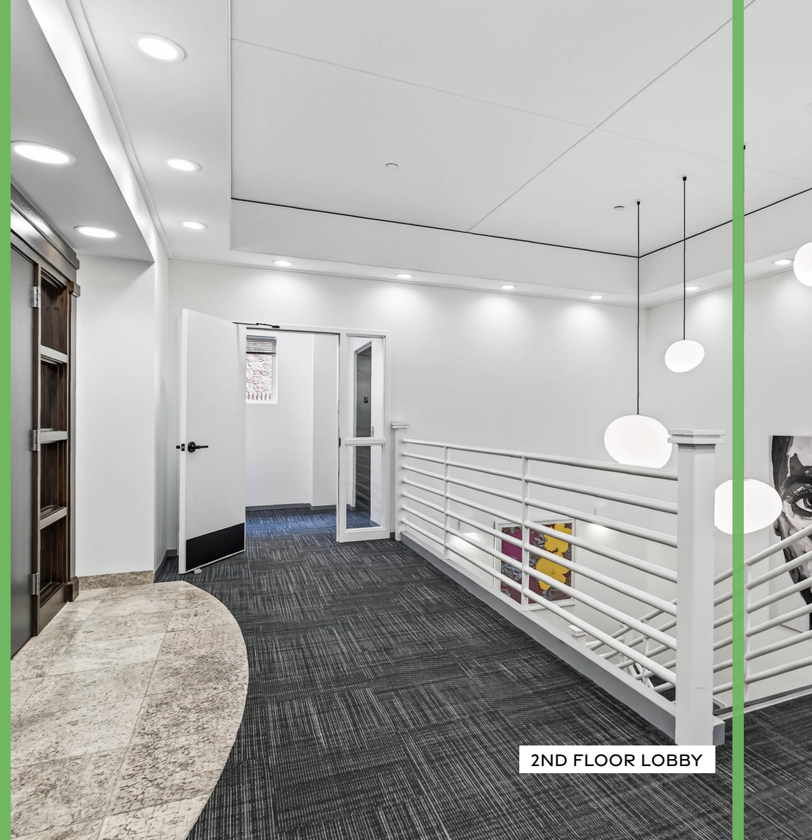
2ND FLOOR LOBBY