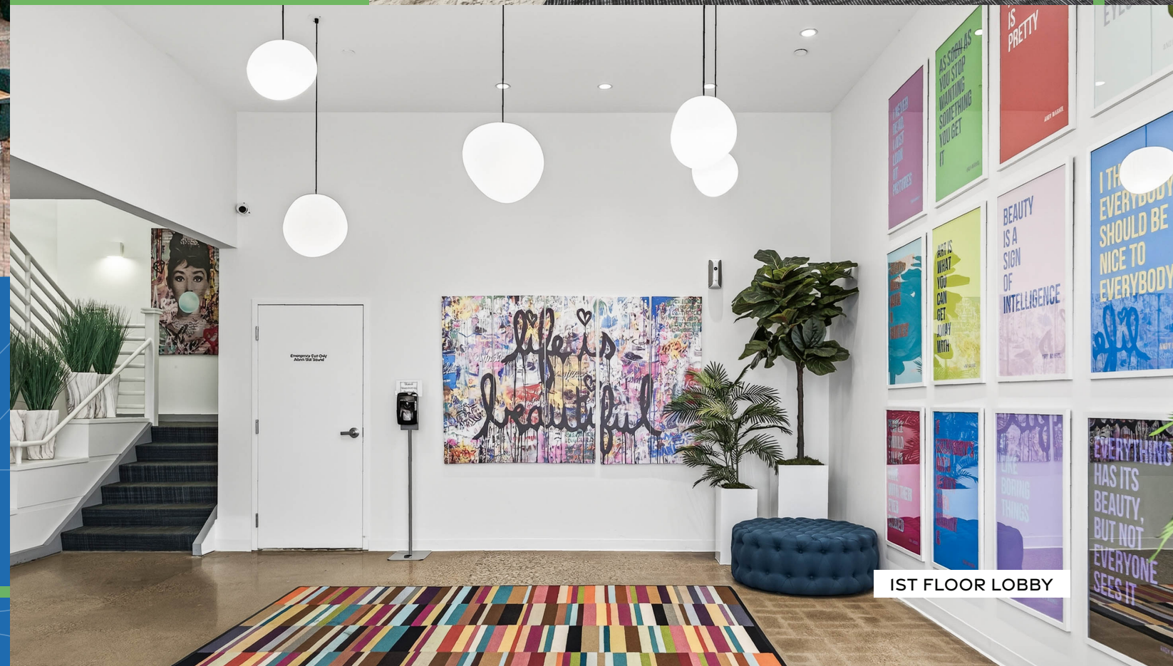
1ST FLOOR LOBBY