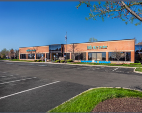
HAMILTON CROSSING II • 12650 Hamilton Crossing Blvd. • Single story