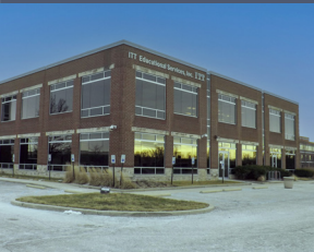
HAMILTON CROSSING V • 13000 North Meridian Street • Multi-story