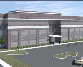
HAMILTON CROSSING VII (PROPOSED) • Multi-story • Build-to-suit featuring extensive highway frontage