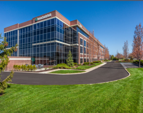
HAMILTON CROSSING III • 12800 North Meridian Street • Multi-story • On-site conference center