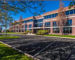
HAMILTON CROSSING IV • 12900 North Meridian Street • Multi-story