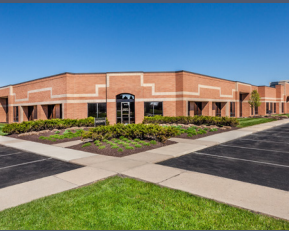
HAMILTON CROSSING I • 12722-12802 Hamilton Crossing Blvd. • Single story