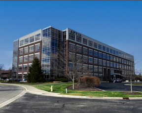
HAMILTON CROSSING VI • 13085 Hamilton Crossing Blvd. • Multi-story • Fitness center, deli café, highway visibility, structured parking