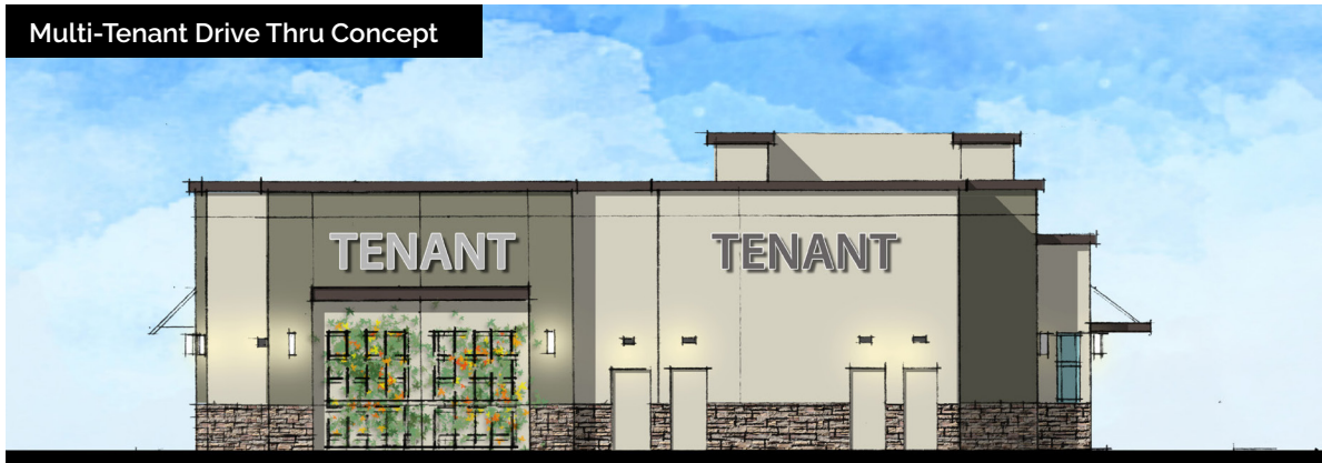
Multi-Tenant Drive Thru Concept