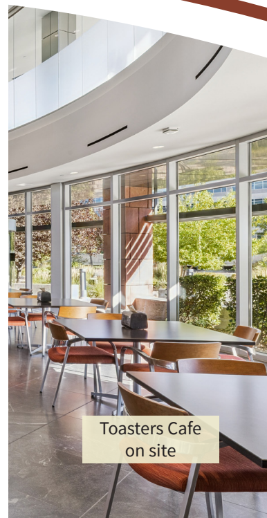
Toasters Cafe on site