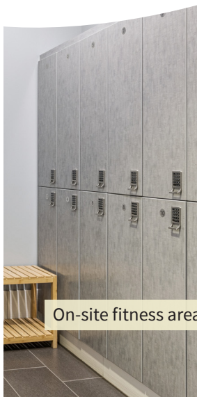
On-site fitness area w/ lockers & showers